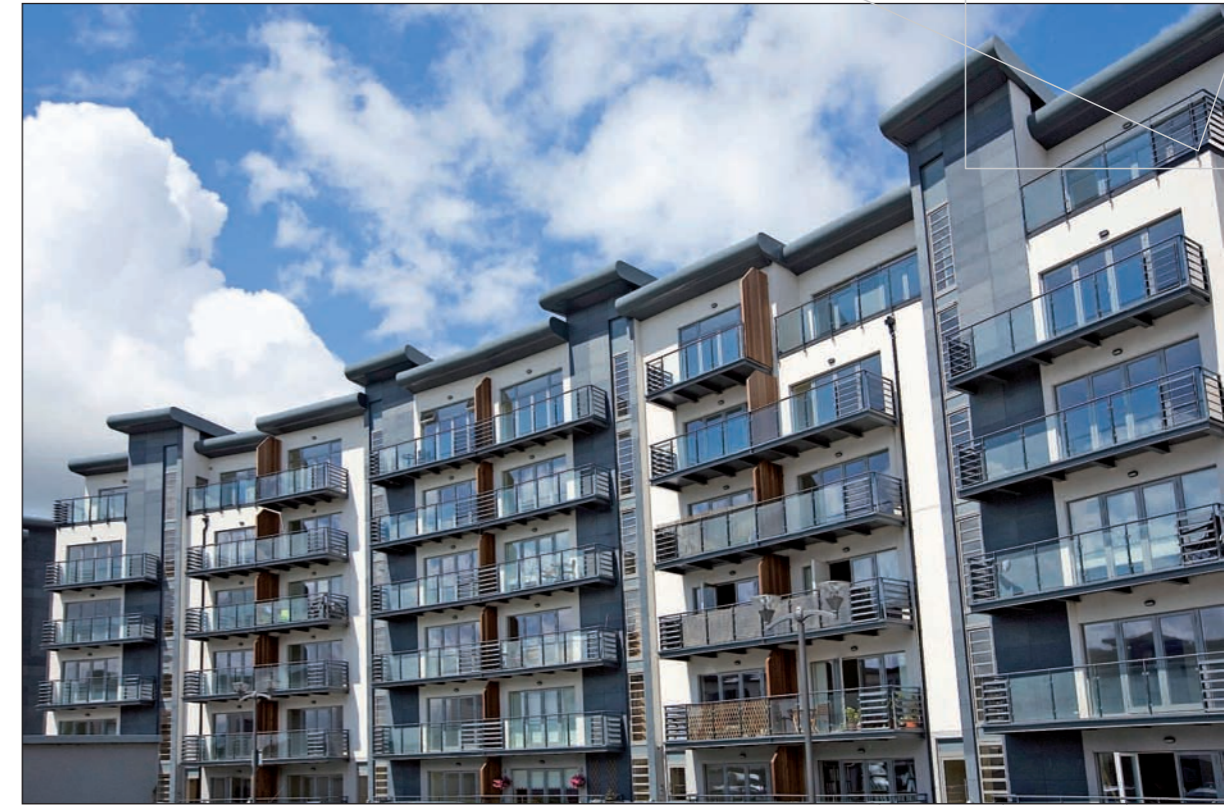
■ TS66 'Energy' Rebated Door System